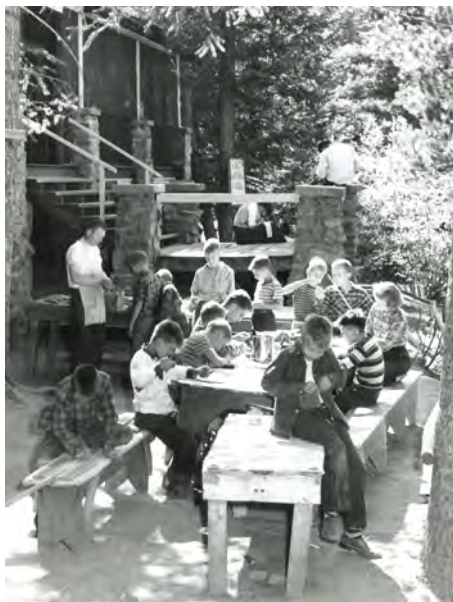
Here’s an old snapshot from 1947 in front of Marathon, when the building is only 27 years old! This familiar shield zone that our knights use to paint their shields is where the craft shop was anchored in those days.

Huge shout-out to everyone who has donate to the Marathon Renovation project! We hit (and passed) the $350,000 “break ground” fundraising goal and the plans/permits/contractors are getting the ball rolling. Our ultimate goal is to raise $400,000 so keep those gifts coming – only $38,000 to go!!