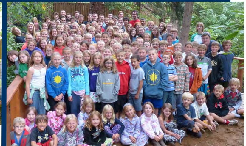
Myths Progeny—and Knighthood II progeny